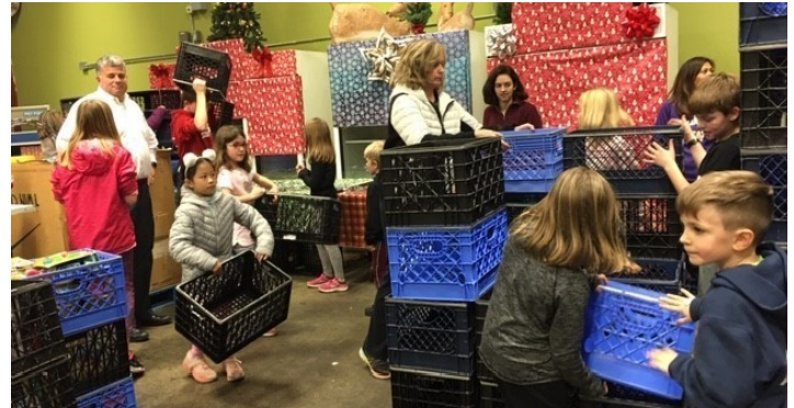
Catholic Kids' Catechism Club Volunteering at Hopelink