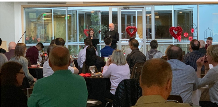
Marriage Enrichment Dinner