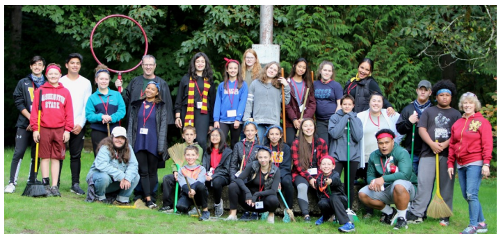
Youth Group Kick-Off Harry Potter Retreat at Camp Don Bosco