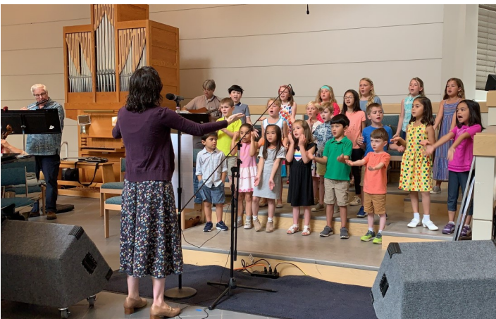
Vacation Bible School Kids Singing at Sunday Mass