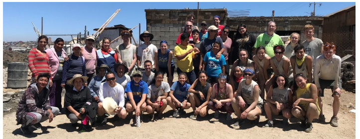
High School Esperanza Mission Trek