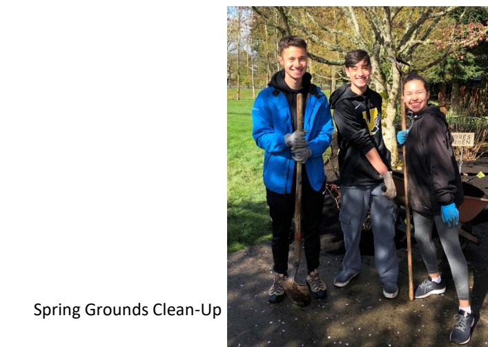
Spring Grounds Clean-Up