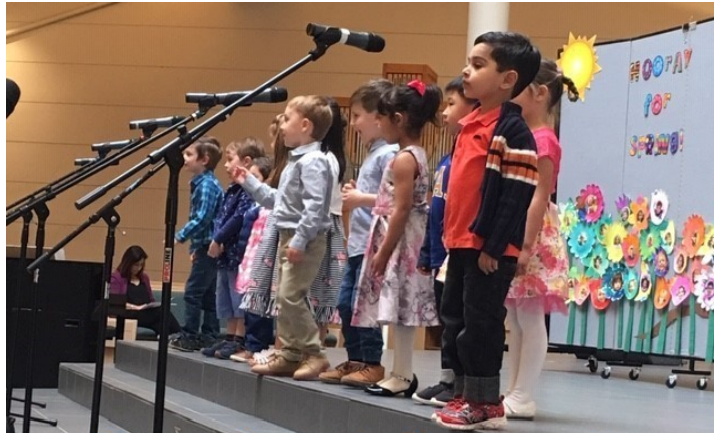
Preschool Spring Concert