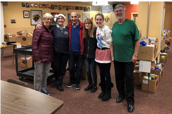
St. Vincent de Paul Christmas Gift Basket Distribution