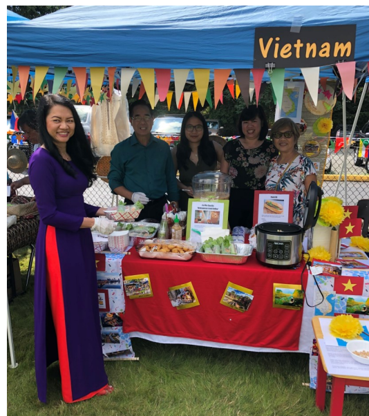
Celebration of Cultures Parish Picnic