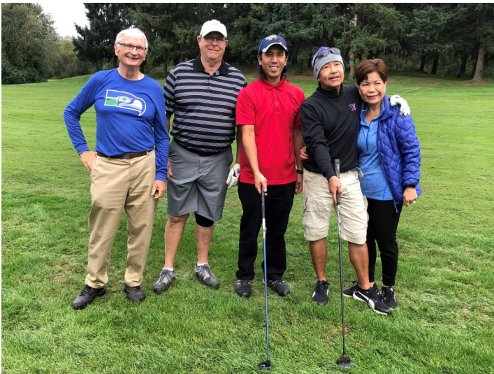
Golf Tournament at Willows Run