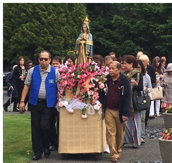
Flores de Mayo