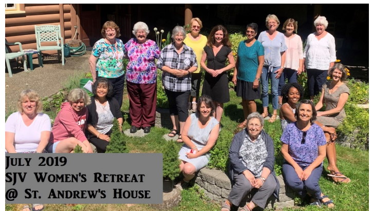
Women's Retreat at St. Andrew's House