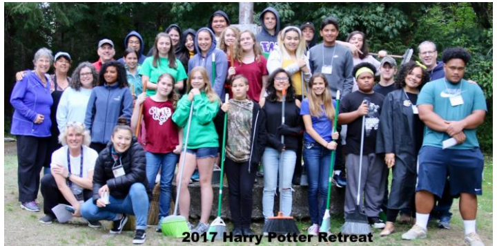
Middle School Youth Harry Potter Retreat