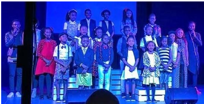
Catholic Kids' Catechism Club sponsored the Watoto Children's Choir

Catholic Kids' Catechism Club microloan business raising money for Operation Rice Bowl