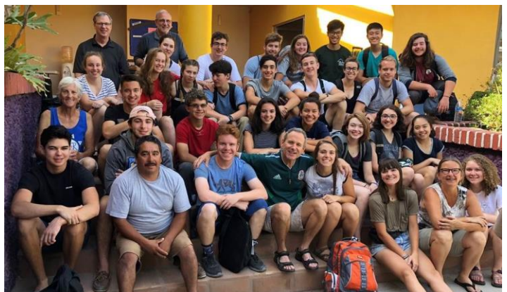
Esperanza Mission Trekkers